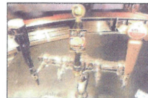
Besides bowling, dining and pool, the Alley will offer an assortment of beers, including microbrews, on tap.