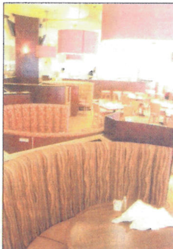
An adjoining restaurant, the 4th Street Bar & Grill, offers a full menu of dining options.