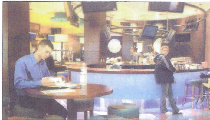
Employees work near the Corner Alley's martini bar while preparing for the establishment's opening.